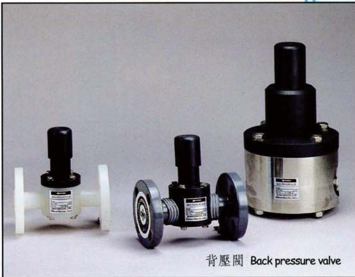
背壓閥 Back pressure valve