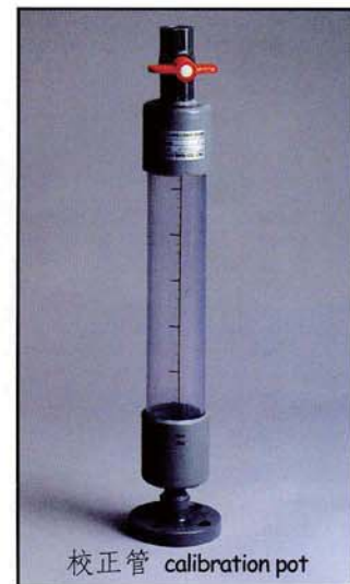
校正管 calibration pot