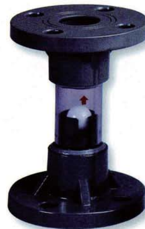
流量檢視器 Flow checker