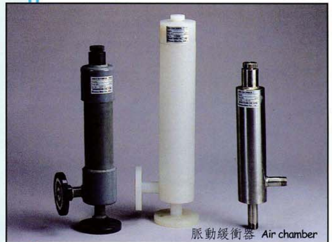
脈動緩衝器 Air chamber