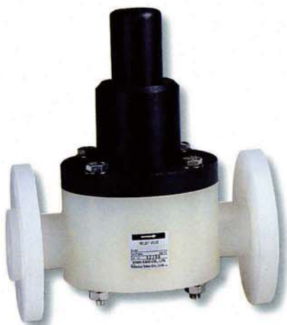
釋壓閥 Relief valve